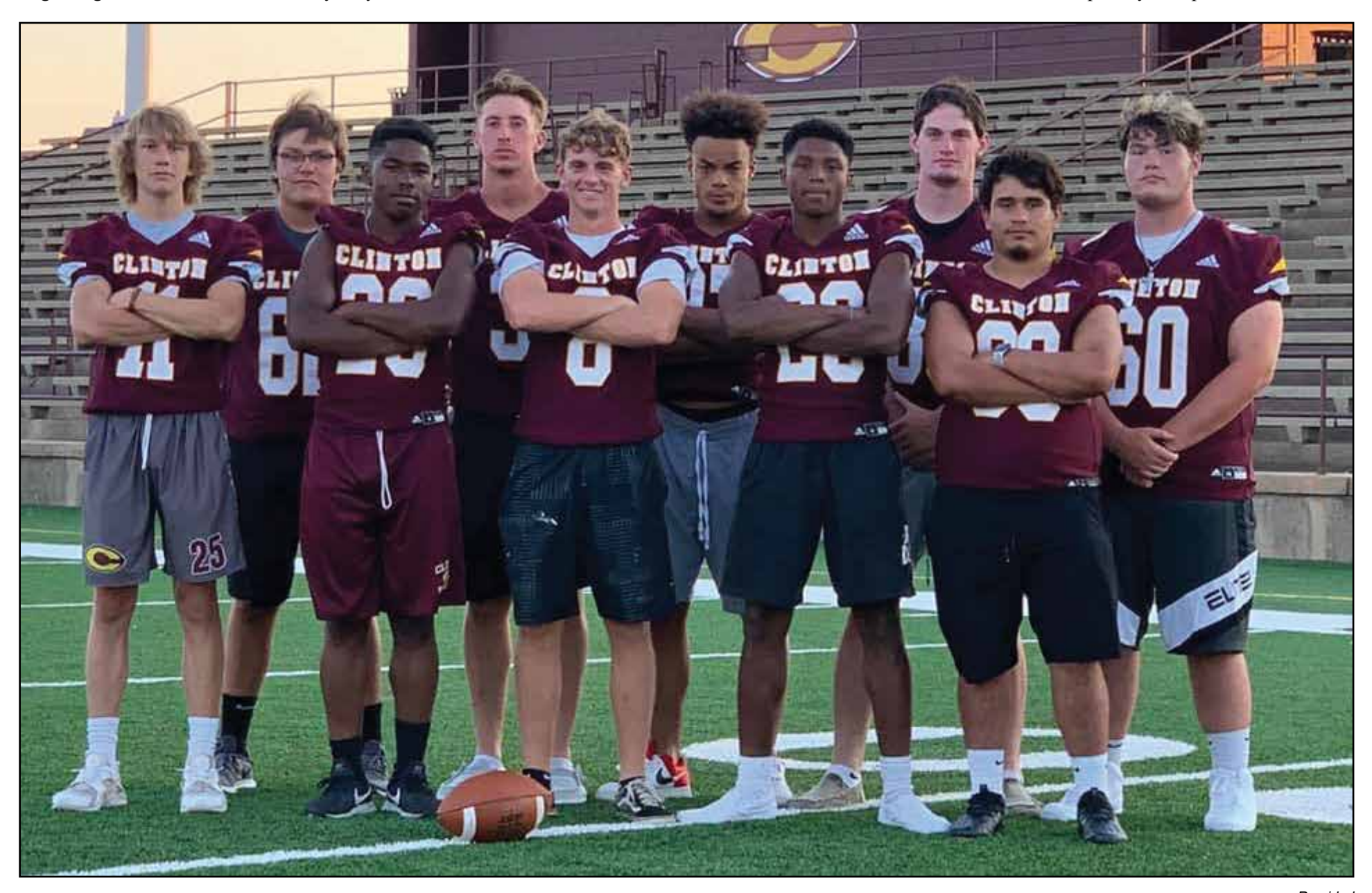
Provided Clinton Red Tornados are scheduled to begin their season Friday, September 4th at home against Woodward Bombers. Catch all the action on TornadoTV at wright. media or tune in to 97.3FM.

Football season begins for Weatherford, Clinton and into the live action, so you won't miss a thing. You can coverage online at "wright.media." Schedules will be posted through our Facebook page. Any changes will