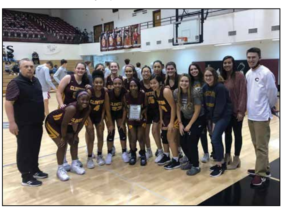
The Clinton Lady Reds beat The Altus Lady Bulldogs in OT with the final score 46-47!! Lady Reds win 3rd place in the Weatherford Classic last weekend.