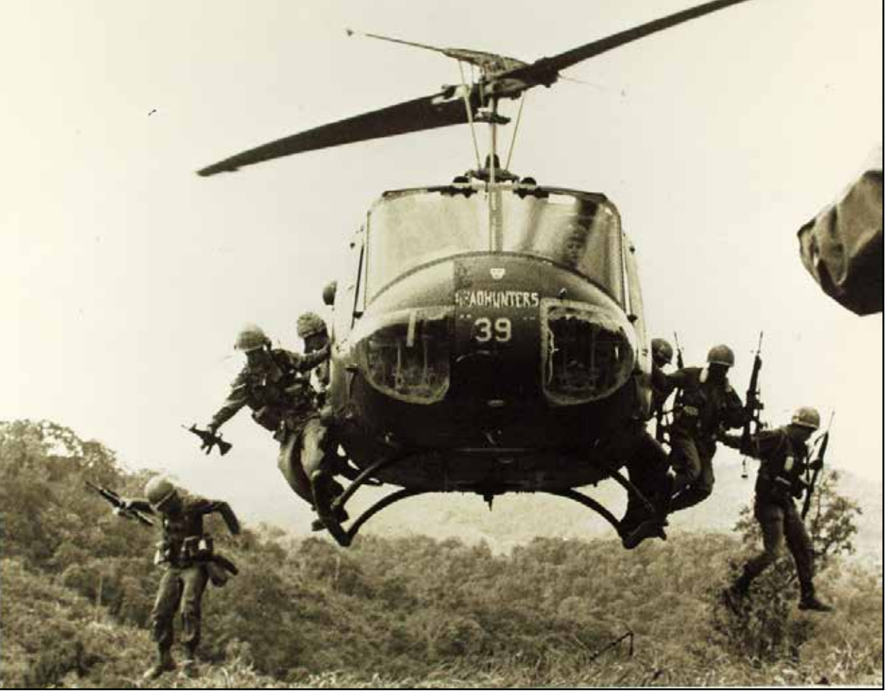
Provided ently installed at