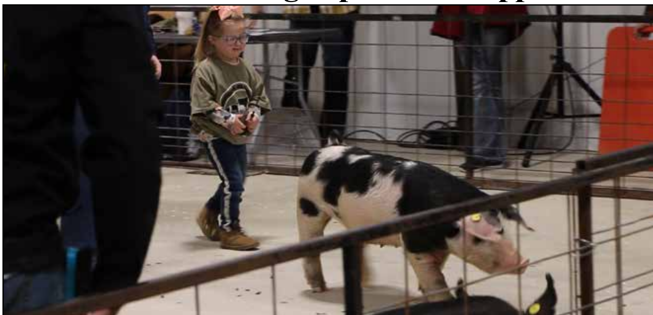
Alex Shook / WW