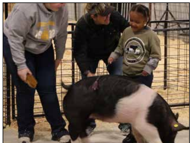
Alex Shook / WW